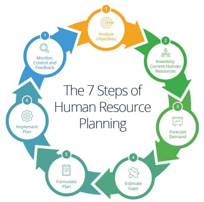
Figure 1: Human resource planning [13]

HRM policies help an organisation provide opportunities and benefits to the workers. It helps to increase the effectiveness of the industry and online shopping uses it to provide good services to users. Myntra uses these policies to improve their business and it also helps them to control the business properly. Myntra wants to internationalise its business with the help of HR policies and it helps to hire employees [13]. Online marketing can be used to manage their staff and it can be used as a strategy for business. It can explore the ability of the workers for the work and it can direct the staff for the work. HRM policies have some important elements such as opportunity policy, hiring and recruiting policy, offboarding and termination, bonuses and salaries and safety [20]. It can encourage the workers which is essential for an organisation. A company should provide safety to the workers and it helps to inspire the employees. It aids to motivate the employees or staff in an organisation. A company should provide good salaries and rewards to the workers because it helps to inspire them properly [14]. HRM policies help to use the internet and it can provide benefits to the workers. Disciplinary actions of a company can be improved with the help of HRM practices and it can manage the staff. It can increase the confidence of the workers in the work and it can solve any problem in the organisation. It helps to improve the performance of digital marketing.