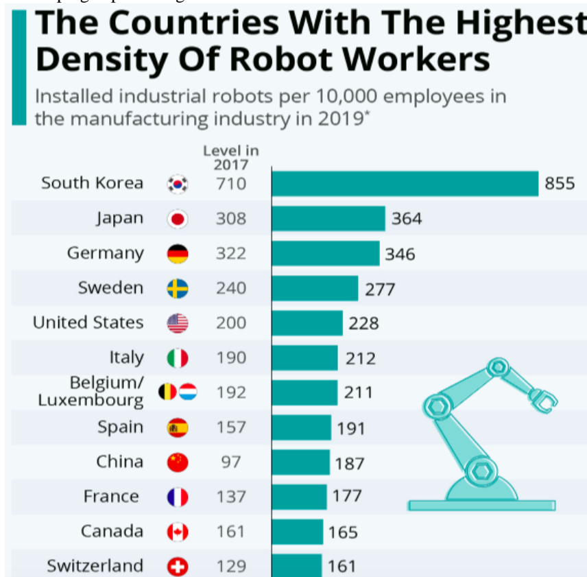
Figure 4: The countries are using robots as workers

employees by maintaining productivity levels. As receptionists, social robots are used that are helping to provide valuable information for the visitors and also ensure a proper greeting for the visitors[8]. As a teaching assistants, social robots are used that are helping to provide an accurate way of learning the interaction and one-on-one attention with students. As an educational tool social robots are used in an effective way to ensure progress in learning. Different countries are using social robots as workers in industries which is beneficial for providing better development in every sector[21]. The majority of using social robots in south Korea and Switzerland is the least density of robot workers in the country as per the data that developed from the survey of manufacturing industries held in the year 2019. These data are beneficial for understanding different objectives of using social robots in industries that are helping to gain growth and provided a visible difference in the country in every way.