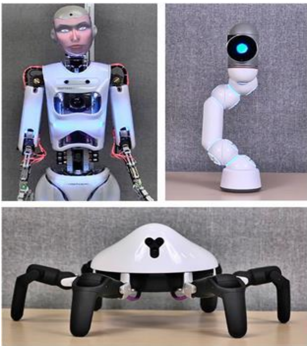
Figure 1: Types of different social robots used for interacting with humans

digital data with robot programs for gaining meaningful interaction. A scientist makes robots for various purposes and includes various kinds of power full technologies, devices, sensors, and many circuits. Artificial intelligence, microphone, cameras, control system, drivetrain, and manipulators are the basic components of social robots[1]. On the other hand, to create robots, the robot scientist need requires to input Elastic Nanotubes, Electroactive polymer, motors, and piezo motors in the body of the robots. According to, the Air muscle is one of the powerful devices that provides the force of pulling and it also behaves as a biological muscle. These social robots behave like a human and also interact with humans. It makes a huge impact on human psychology and also promotes modernization. Researchers try to investigate the effects of the relationship between humans and robots. From several studies, it has been seen that these kinds of robots create an easy lifestyle for human beings and also improve their daily lifestyle. In the workplace, the social robot has a major role and it can able to do innovative work and also better than humans.