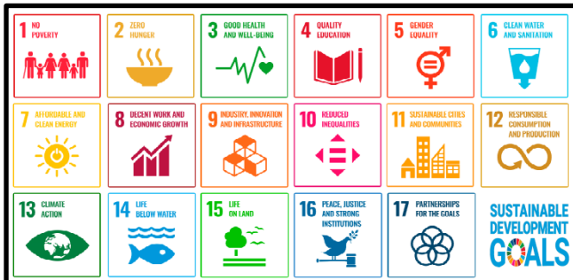
Figure 3: Sustainable Development Goals of the UN[26]

organisations focused on promoting health, gender and economic inclusion. Founded in 1945, this organisation has aimed to prevent conflicts and protect the security, peace and human rights of people. The Security Council under the UN is responsible for detecting risk factors creating threats along with developing potential solutions to foster peace.