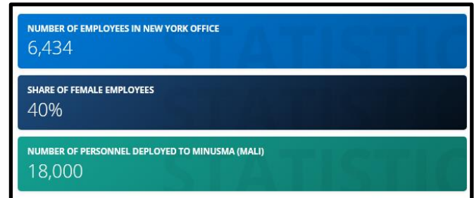
Figure 2: Volunteers and workers of the UN [21]

collaboration with various other international organisations for improving and resolving humanitarian and financial issues. These organisations include the “ International Labour Organisation ”, “ World Bank ” and “ The International Monetary Fund ”.