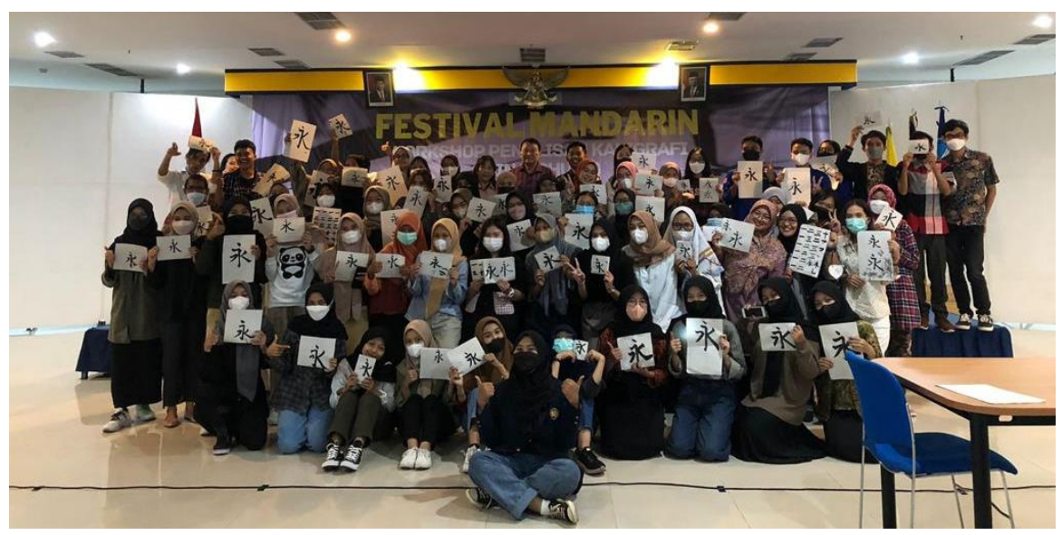
Figure 2. Chinese Caligraphy Trainee